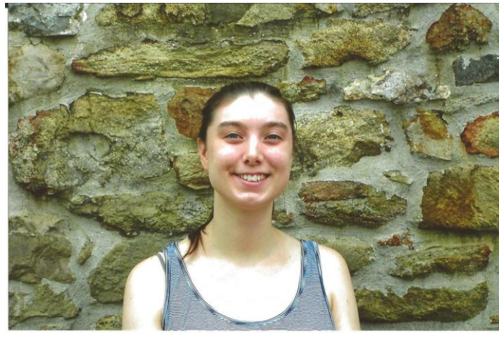
Allison Mc Causland

The photo above shows Earl Hill after putting the finishing touches on a new plexiglass wall, which will enable visitors to the Heller-Wagner Grist Mill to safely observe the turbine wheels which were added to the Mill as a modernization effort in 1875. This modernization consisted of the addition of two horizontal Fritz-Hanover Turbine wheels of 40 and 44 inches in diameter, producing approximately 4 and 6 horsepower respectively. When it was installed in that time period it was considered a significant addition to the 1767 Heller-Wagner Grist Mill.