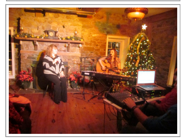
Thank you for celebrating the season with us!