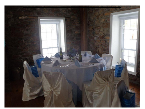
Baby shower in the Tavern Room catered by Saylor's & Co.

Word of mouth continues to spread that the Tavern Room at the Heller-Wagner Grist Mill is the perfect venue for intimate social gatherings. 2014 dates are filling up fast. Book your event now!