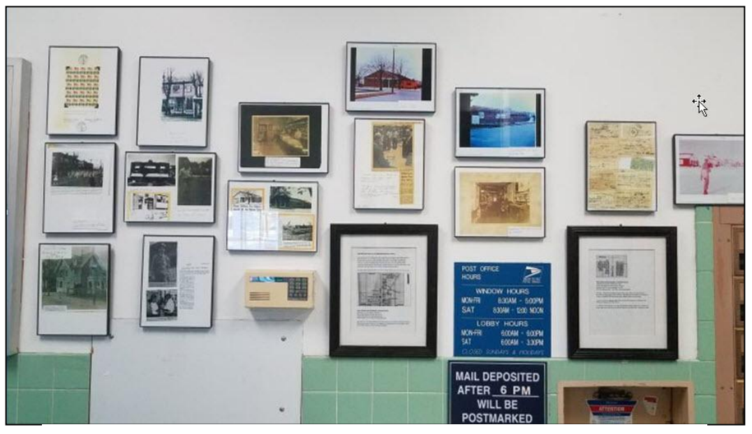
Various photos, documents and other items borrowed from the Historical Society are hung in the Post Office Lobby for viewing during the 50<sup>th</sup> Celebration.