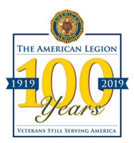
The local post plans a 100<sup>th</sup> Anniversary Celebration at the Legion for March 23, details yet to be announced.