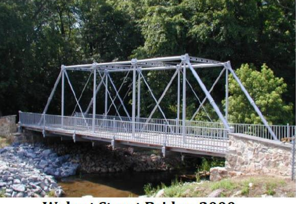
Walnut Street Bridge, 2000