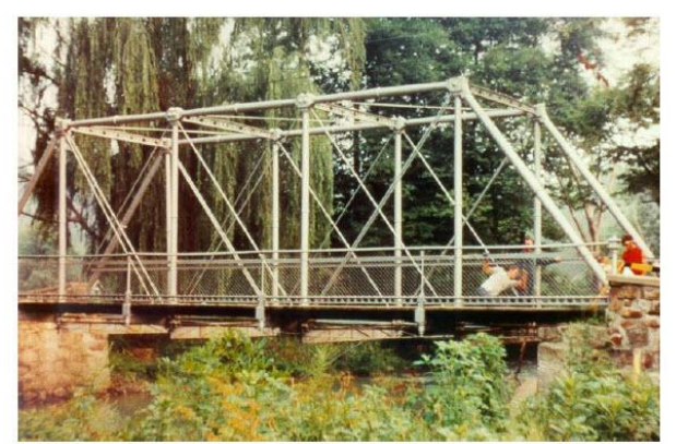
Walnut Street Bridge, 1970

The bridge formally reopened to pedestrian traffic in June 2000 serving the Community as a foot bridge and important part of local Hellertown history. The bridge is now part of the National Parks Service Historic American Engineering Record Collection cataloged as PA-206.