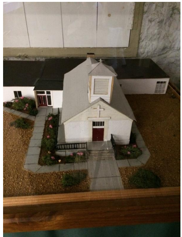
Clockwise from Top Left – Hellertown Borough Hall, Heller-Wagner Grist Mill, The Historical Society's Pony Bridge, Mountainview Moravian Church