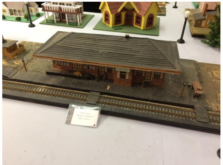
Clockwise from Top Left – Hellertown’s Lodge Hall, The Weisel Harness Shop, Detweiler Plaza/Clock Tower, The Reading Railroad Station