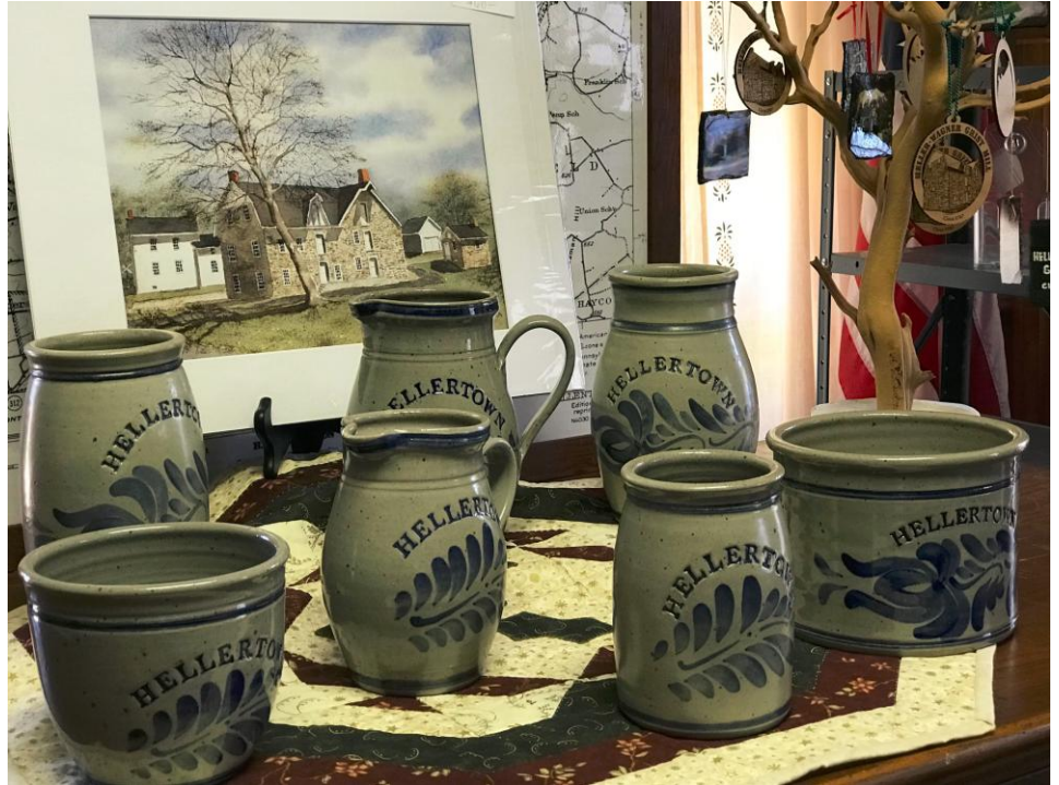
Back row: 2 Quart Jar - $20, 2 Quart Pitcher - $27, Flower Vase - $25 Front row: Small Crock - $20, Quart Pitcher - $21, Quart Jar - $20, 2 Quart Salt Crock - $26.

The new pieces added to our collection are: