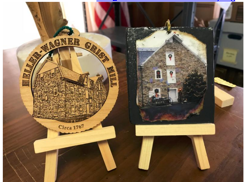
Wood: $6 Slate: $10

Call 610-838-1770 or email info@hellertownhistoricalsociety.org