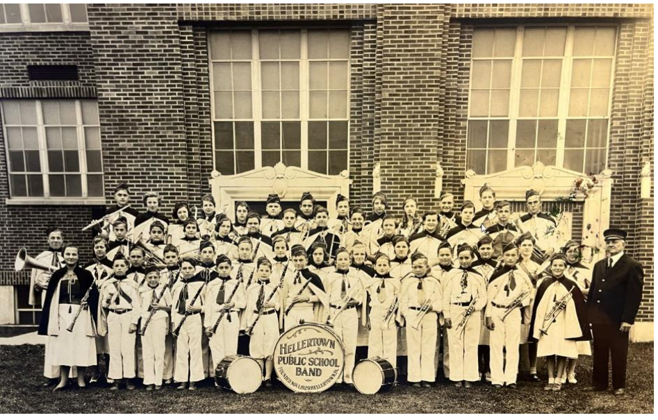
Hellertown-Lower Saucon High School Band Circa 1933

Today the Saucon Valley High School Band consists of instrumental students in grades 7-12. The program offers competitive marching band, symphonic wind ensemble and a jazz ensemble that perform several concerts, competitions and parades throughout the academic school year.