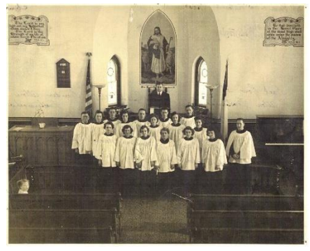
A Choir Assembled Inside the Church Unknown Date

He stood on the huge rock in front of the schoolhouse and began his preaching. At the close of the meeting, a school director approached him and told him he was banned from preaching in town.