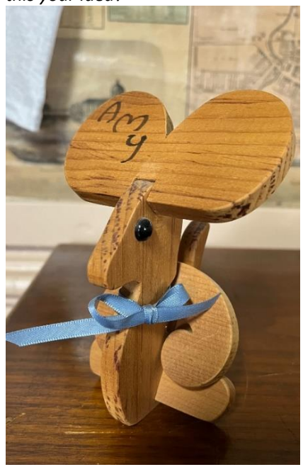
A wood puzzle of "Amy", created by volunteer Earl Hill, currently sits on a shelf inside the front room of the Millers House

Editor – I have seen some of the older editions of newsletters and they feature a much different perspective, that of a mouse named Amy? Was this your idea?