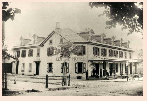
Central Hotel (Now Hellertown Borough Hall) Early 1900's

SV Easter Egg Hunt – March 30 HHS Speaker Series – April 25 History-Heritage Day – May 18 Music in the Park – June 23 Community Day – August 17 Speaker Series – September 10