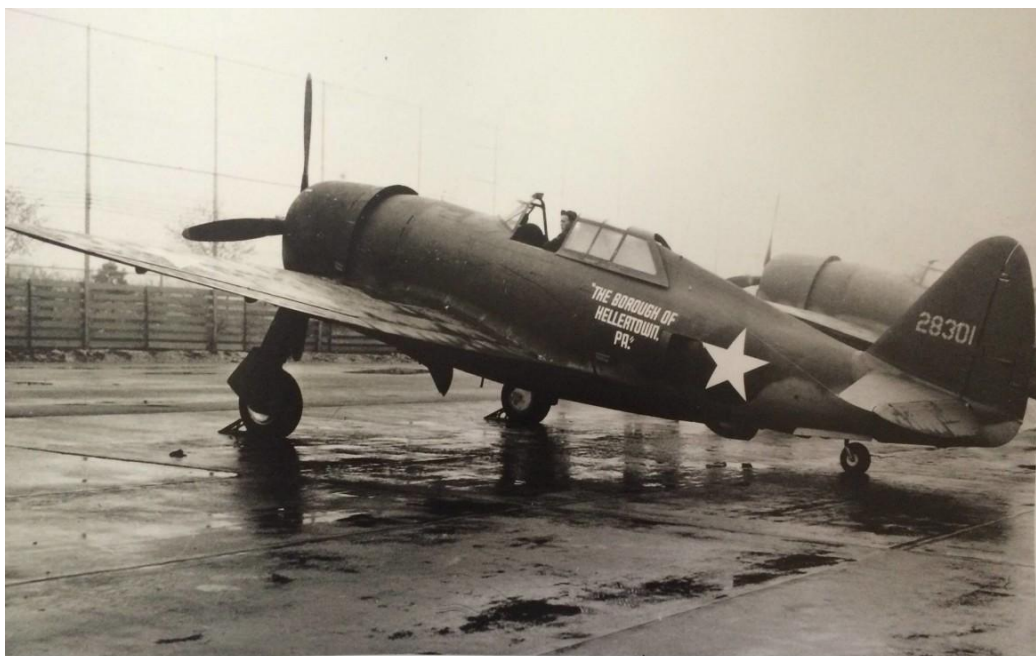
P-47 THUNDERBOLT WWII Named after the Borough of Hellertown in 1943 for a successful War Bond Drive

The life of the plane remains incomplete, but Government files seem to suggest that it was assigned to Camp Springs Army Airfield, MD which is now Andrews Air Force Base, to serve as a training aircraft. Military records show that the plane was scrapped February 17, 1945.