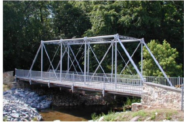
Walnut Street Bridge, 2000