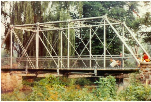
Walnut Street Bridge, 1970

The bridge formally reopened to pedestrian traffic in June 2000 serving the Community as a foot bridge and important part of local Hellertown history. The bridge is now part of the National Parks Service Historic American Engineering Record Collection cataloged as PA-206.