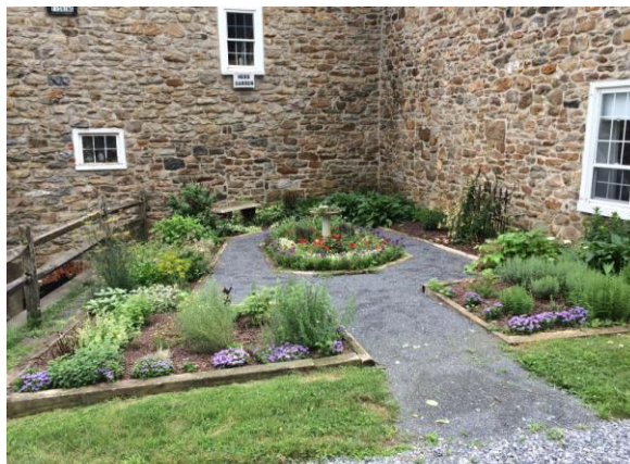
Hellertown Historical Society Herb Garden (Adjacent to Mill Race)