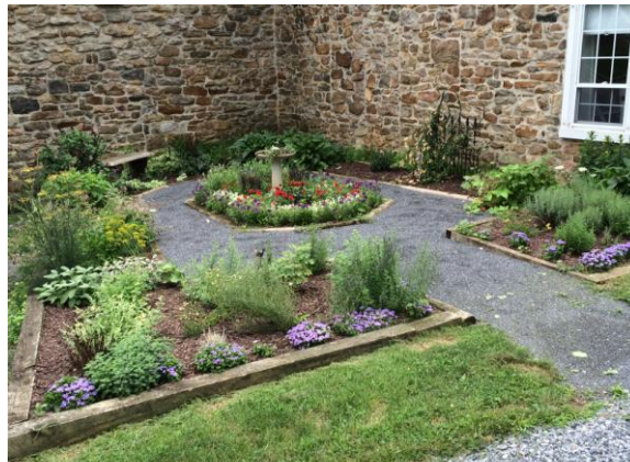
Hellertown Historical Society Herb Garden (Against Grist Mill)

Should anyone wish to donate time or materials to complete the needs or maintenance of the herb garden, please contact the Historical Society via email or phone using the contact information found on the front page of this Newsletter.