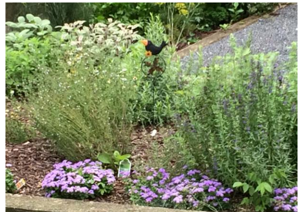
Hellertown Historical Society Herb Garden (Closer View)