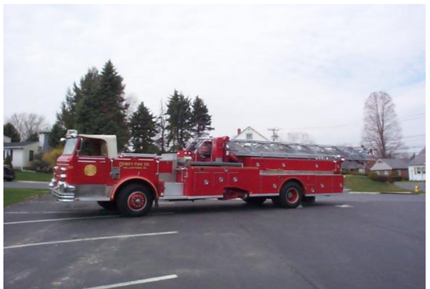
1966 Maxim 100' Aerial Truck - #402

Like the aerial truck mentioned above, similar aging issues were appearing in the current Rescue truck. With the recent construction of I-78 and an interchange at the North end of Hellertown, Dewey Fire Company became responsible to handle emergency responses to a broad section of this superhighway in both directions of the interchange. The current rescue truck did not support the required tools necessary to effect rescues for this type of response and the truck itself was not suitable for this type of travel. It was determined that not only would a new truck be required to transport such tools and personnel, but new tools and equipment would also be necessary.