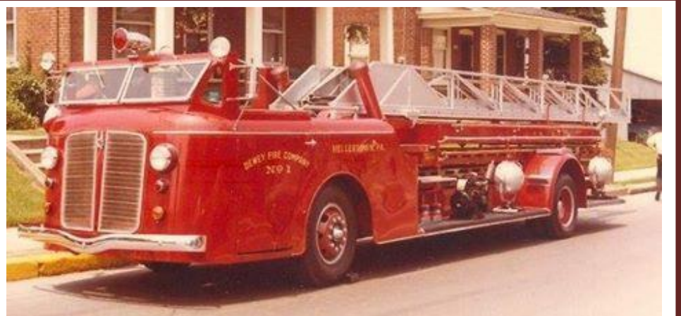
1940 American LaFrance 85' Aerial Truck - #402