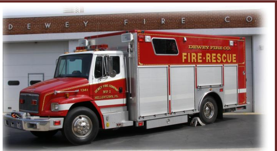
1989 Freightliner/Marion Medium Rescue Truck - #403

Over the years, the fire apparatus has changed, some trucks