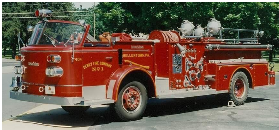
1959 American LaFrance Pumper - #404