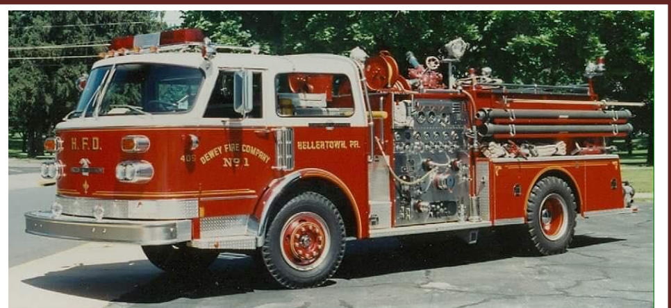
1977 American LaFrance Century Pumper Truck - #405