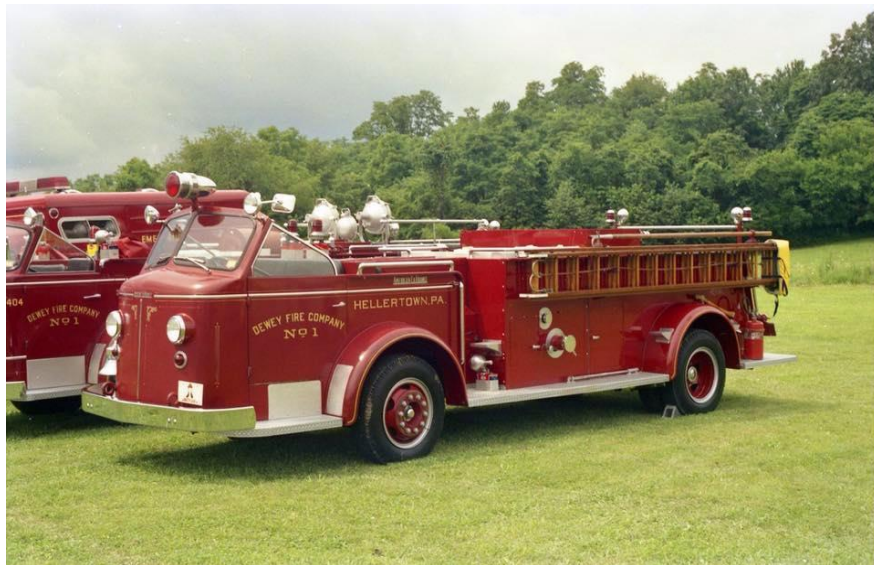
1956 American LaFrance Pumper - #401