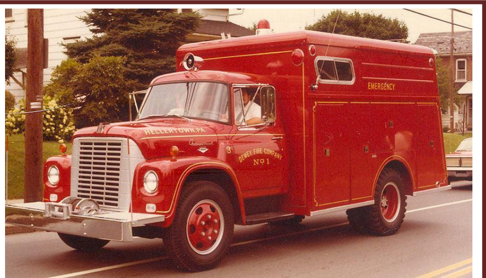
1966 International Rescue Truck - #403

Shortly after I joined the fire squad, Dewey took delivery of a new piece, a 1977 American LaFrance 1000GPM pumper, for a total of